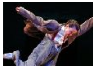
MICHELLE DORRANCE TAP/BALLET HYBRID