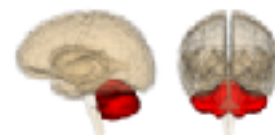
PSYCHOLOGICAL BENEFITS OF DANCE ARTICLE